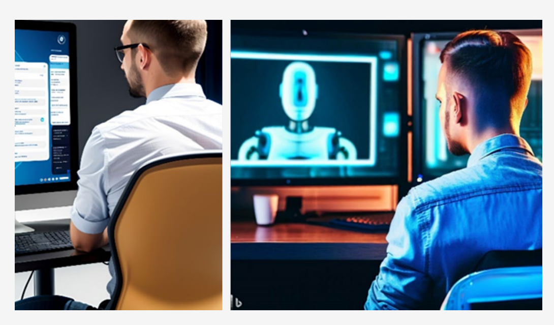
Figure 1: Two Images Generated by Different AI Platforms Given the Same Instructions.